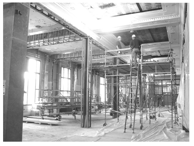
BELOW: The interior of the first floor of the Davenport Court House under renovation.